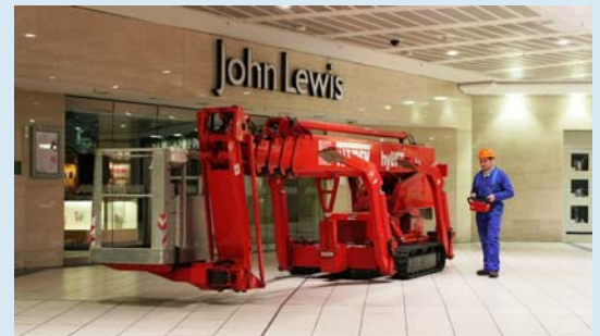
The LE030T is equipped with a Diesel engine for outdoor and a 230 V electric motor for indoor use. A 400 V AC motor is optional.

LEO = Model, Number = Metric Working height, G = Articulated, T = Telescopic