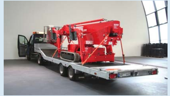
With the powerful track drive and the radio remote controls loading is safe, quick and easy.