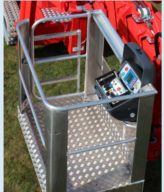
All functions are controlled from the radio remote controls. An interactive display in the control panel shows all available boom functions, safety information and allows error analysis.